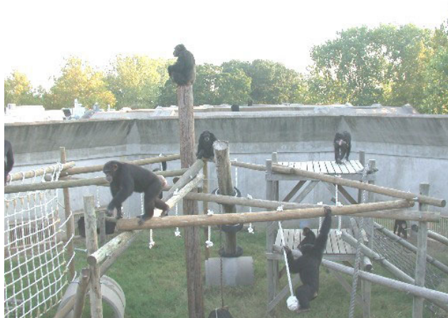
Chimps at MD Anderson Science Park